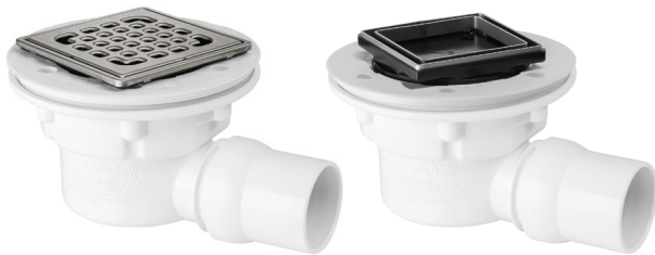
Stainless Lid 1000.161