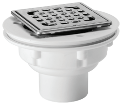
Stainless Lid 1000.171