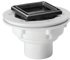
Tile Insert 1000.172

Flow rate ..... 80-140 l/min Water seal ..... None Inlet size ..... 100mm Outlet size ..... 50mm